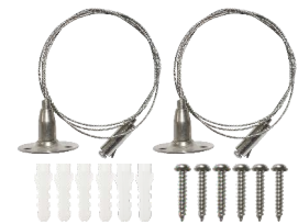
Suspended mounting kit