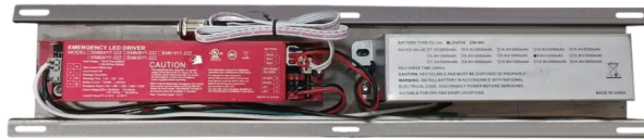
15W Emergency battery backup